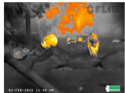
Graded Fire 1&2: The hottest things in the image are shown in a gradient of color while everything else is greyscale