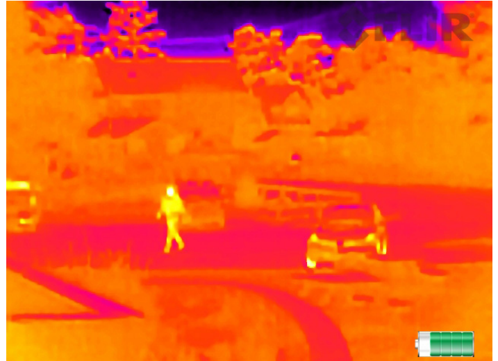
The FLIR Scout TKx helps you stay aware in the dark of night

The FLIR Scout TKx is a pocket-sized thermal vision monocular for exploring the outdoors at night and in lowlight conditions. This thermal monocular with an extended battery life reveals your surroundings, allowing you to clearly see people, objects, and animals from more than 90 meters (100 yards) away. The Scout TKx records thermal images or video in multiple color palettes that can enhance viewing, including InstAlert™—a greyscale palette that adds color to highlight the hottest object in the scene. Simple to use, the Scout TKx is the perfect companion, whether in the countryside or on your own property.