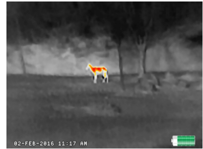
InstAlert: The hottest object in the image is colored while everything else is greyscale

For more information contact: Sales@TeledyneFLIR.com or to find your local support number, visit: flir.com/contactsupport